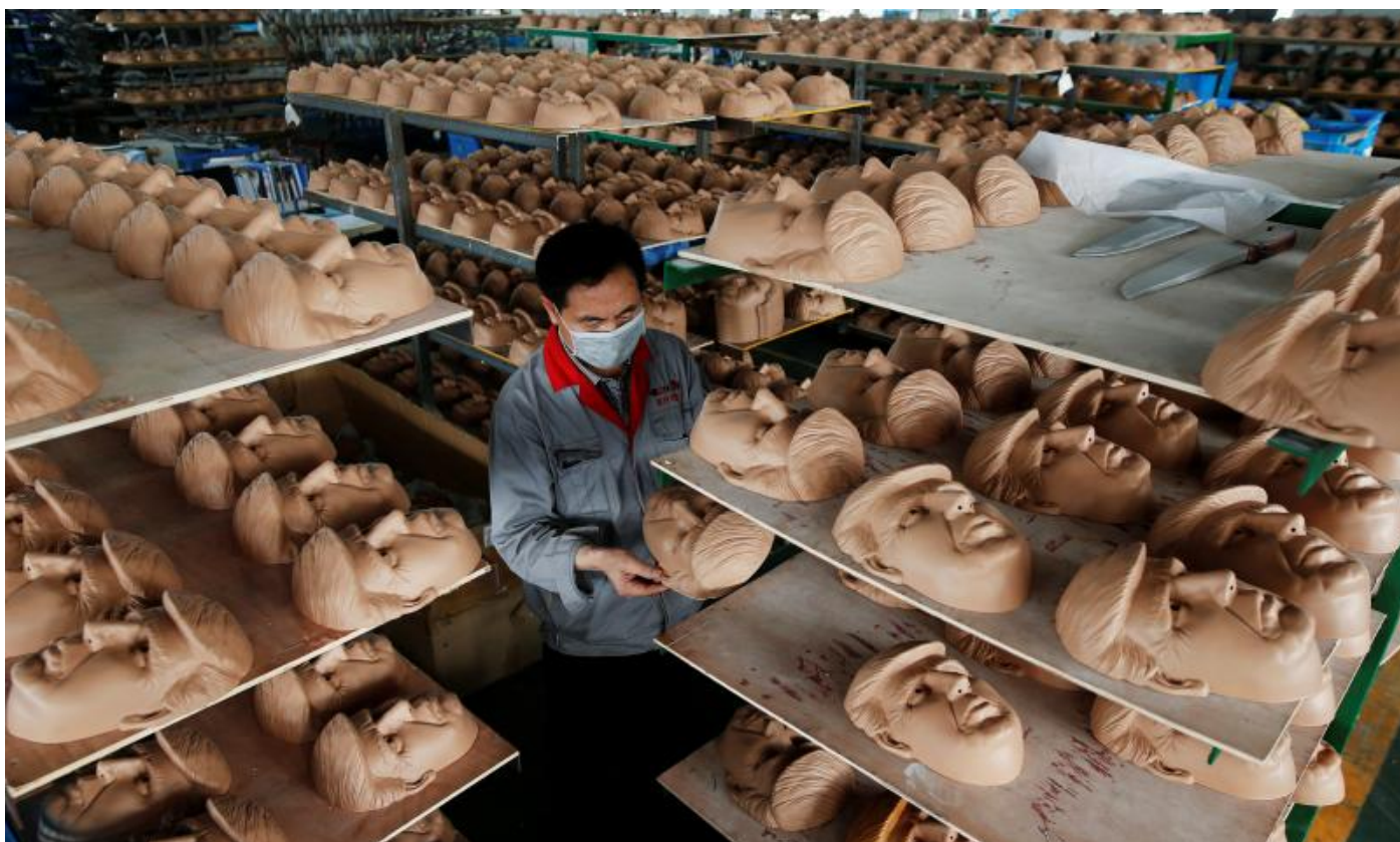
A worker inspects a mask of then-presidential candidate Donald Trump in Jinhua, China, May 2016.

proposal for trade expansion in Asia Pacific, the Regional Comprehensive Economic Partnership (RCEP), specifically allows for many differentiations on tariffs and industry standards based on participating countries' varied economic and political conditions.